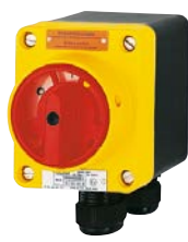
3-pole EMERGENCY STOP