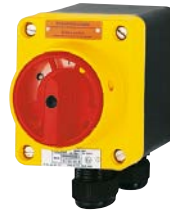
3-pole EMERGENCY STOP