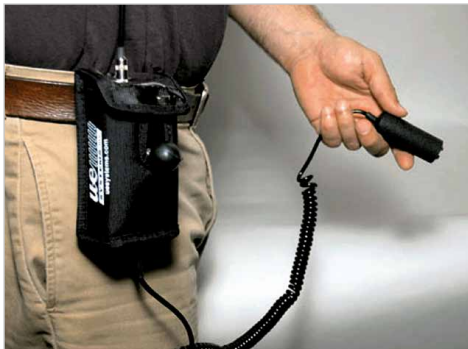
Holster for UP 201