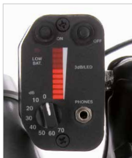
LED display and sensitivity dial