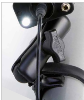
Mounting kit included