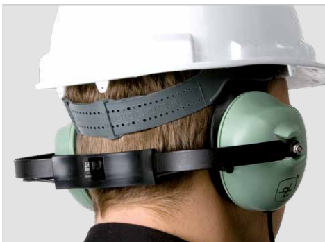
Headset for hardhat use