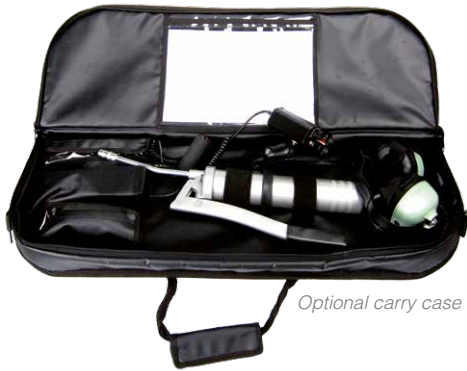
Optional carry case