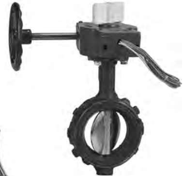
WD-3510-8** Wafer (4" Shown)